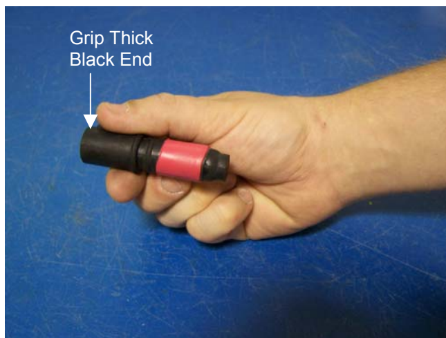
Figure 1: Grip the Plug on the Black Rubber End

Push and pull the plug straight onto and off of the bulkhead without rocking, bending, or twisting the red end. Applying a small amount of DC-55 lubricant to the inside of the dummy plug will help the plug slide on and off more easily.