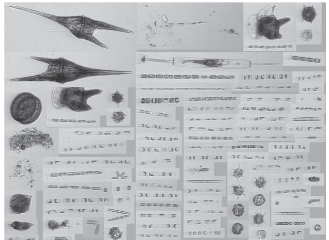
Example Mosaic from IFCB Dashboard (not to scale)

This product complies with 21CFR1040.10 and 21CFR1040.11