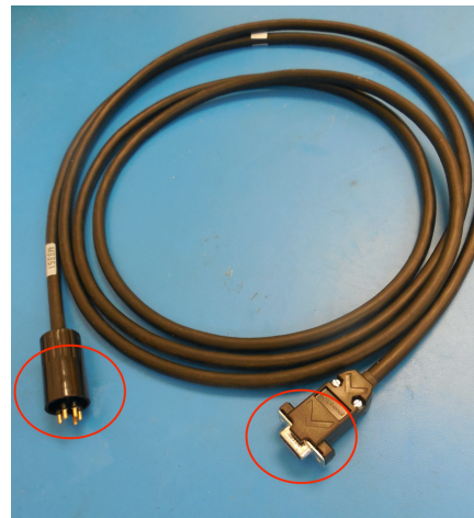
Figure 2: CF2 Communication Cable (DB9 Serial Connector)