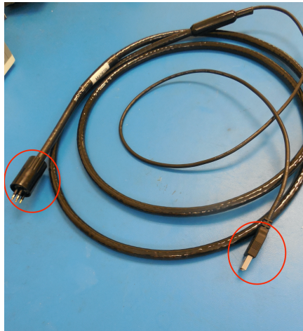
Figure 1: Gen3 Communication Cable (USB Connector)

NOTE – The communication cables are not interchangeable between Gen3 and CF2 electronics.