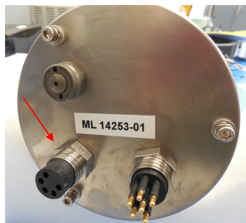
Figure 4: CF2 5-pin MCBH Connector