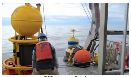
ESP on the Deck

Environmental Sample Processor (<u>ESP</u>) sampling techniques are making it possible to analyze not only the individual activities of microbial populations but also the temporal dynamics that define their ecological niches. Through the ESP in situ collection, the