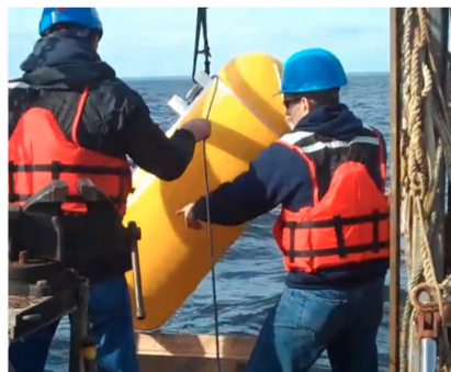
McLane Testing at Sea

McLane, along with customer and industry partners, recently took McLane Moored Profilers (MMPs) into the ocean to test a prototype profiler with new sensor integration, inductive telemetry, and mechanical enhancements.