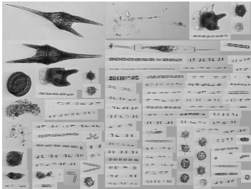
IFCB Images from the Web Dashboard

Images from the first commercial Imaging Flow Cytobot (IFCB) unit McLane has delivered are now visible through a web dashboard . The IFCB features technology from scientists at Woods Hole Oceanographic Institution (WHOI) and is an automated in situ submersible imaging flow cytometer that captures high resolution suspended particle images.