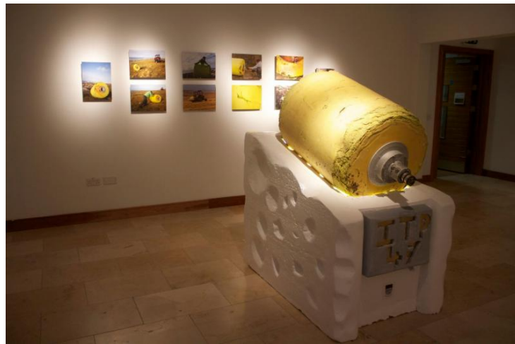
Surface Controller from Arctic ITP on Exhibit in Ireland