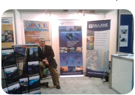
McLane and ROMOR Team up at Oceans '07

In October 2007 McLane journeyed to Vancouver, BC