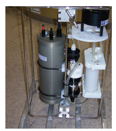
New WTS-LV Design for Millipore Cartridge Filters

New Products and Training, as shown below, have kept us busy collaborating with our customers!