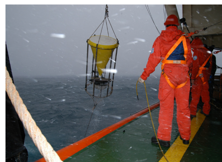
Italian Sediment Trap Deployment Antarctica

Thanks to customers, we have received many great new deployment photos. Some of our favorites are below. We still have McLane t-shirts to trade for your photos. Send to mclane@mclanelabs.com !