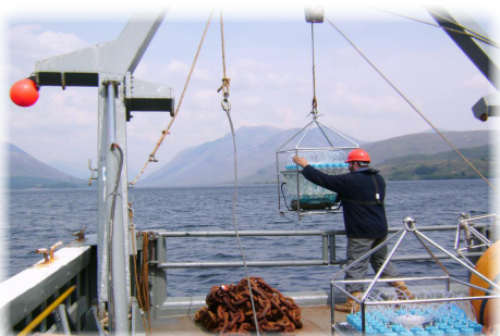
Above: SAMS deploys a RAS-500 in Loch Etive, Western Scotland

In August, Woods Hole Oceanographic Institution (WHOI) engineers deployed four ITPs at Ice Camp Louis in the Arctic.