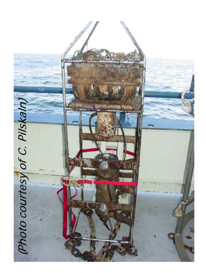
PPS Studies HAB

The Phytoplankton Sampler (PPS) continues to aid in studying the causes and impacts of Harmful Algal Bloom ('HAB', or 'Red Tide') outbreaks across the Gulf of Maine. These PPS deployments are part of a five year Woods Hole Center for Oceans and Human Health (COHH) study that continues in 2007. •