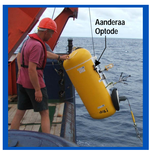
IfM-Geomar Deploys MMP with Aanderaa Optode

Other supported sensors are the Falmouth Scientific CTD & ACM, Sea-Bird UIM (SBE 44) & 52MP CTD, Seapoint fluorometer & turbidity sensors and Wetlabs CDOM fluorometer. •