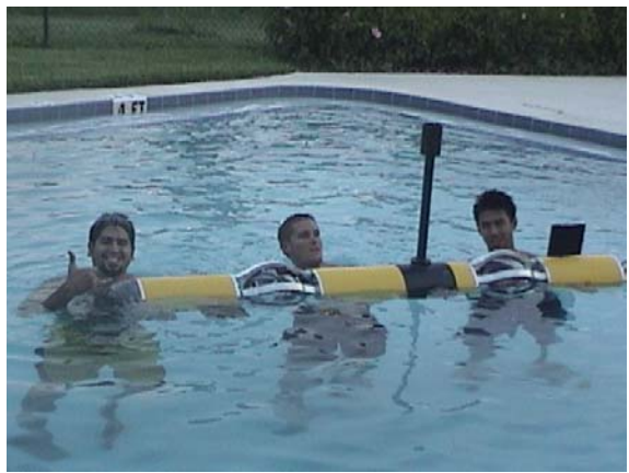
Kamikaze's First Wet Test

The instrument housings supplied by McLane will protect the navigation electronics, with control wiring as accessible and modular as the hull mechanics.