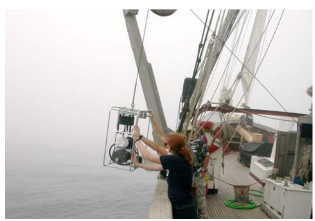
WTS-LV Over the Rail of the SSV Corwith Cramer

Students aboard the SSV Corwith Cramer (C-193) deployed a McLane WTS-LV pump off the coast of Maine during a summer cruise. The advanced placement high school students achieved their goal of gently pumping water through a mesh filter continued on page 2