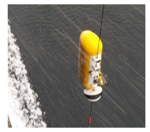
MMP in the Driving Snow 78N/125E

Thanks to our customers for these images of McLane instruments in action! If you have photos of our instruments in the field, email them to us at mclane@mclanelabs.com! �