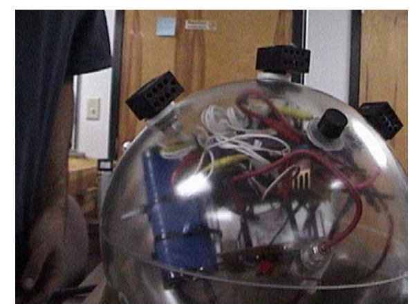
McLane Instrument Housing on the AUV Kamikaze

A new RAS-500 User Manual was published in June. In addition to updates for firmware version 6.0, the manual has been reorganized with many instructional photographs. The RAS-500 User Manual is available on our website. *