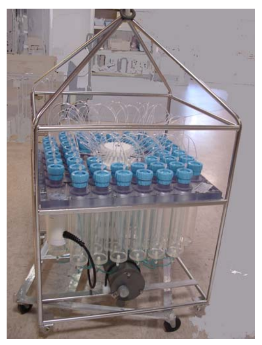
RAS-500 Ready for Testing

External temperature readings are recorded in RAM and in EEPROM. ❖