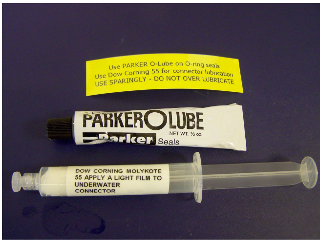
Figure 2: Included in Toolkit