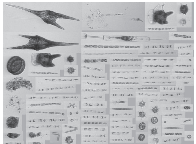
Example Mosaic from IFCB Dashboard (not to scale)

This product complies with 21CFR1040.10 and 21CFR1040.11