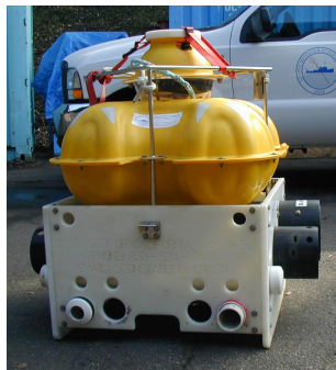
Ocean Bottom Seismometer

The boundary between the continental and oceanic crust in the northeast Atlantic Ocean west of Spain will soon be visible in 3D seismic maps thanks to an international research team. During the Galicia Expedition